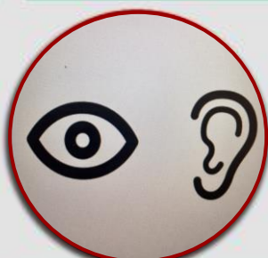
Sensory Impairment ←Team→