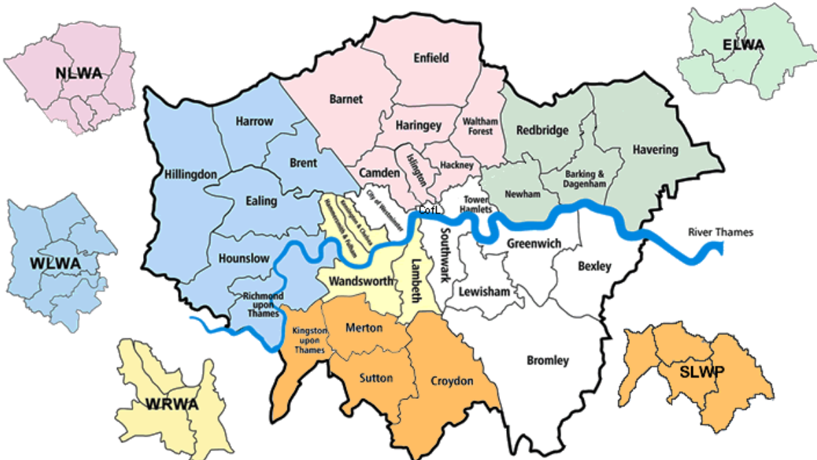
Figure 1: Map of London Boroughs

1.1.2 For OPDC, the Technical Paper only includes the land within the OPDC boundary which falls within LBHF. The remainder of the OPDC’s land falls within the London Boroughs of Brent and Ealing which are part of the West London Waste Authority (WLWA) and Waste Plan (WLWP), therefore these parts of OPDC are not part of the WRWA and not within the scope of this study.