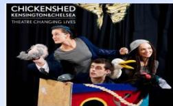
Big Stories from the Little Box

Puppetry, Storytelling & Music 15 spaces ONLY