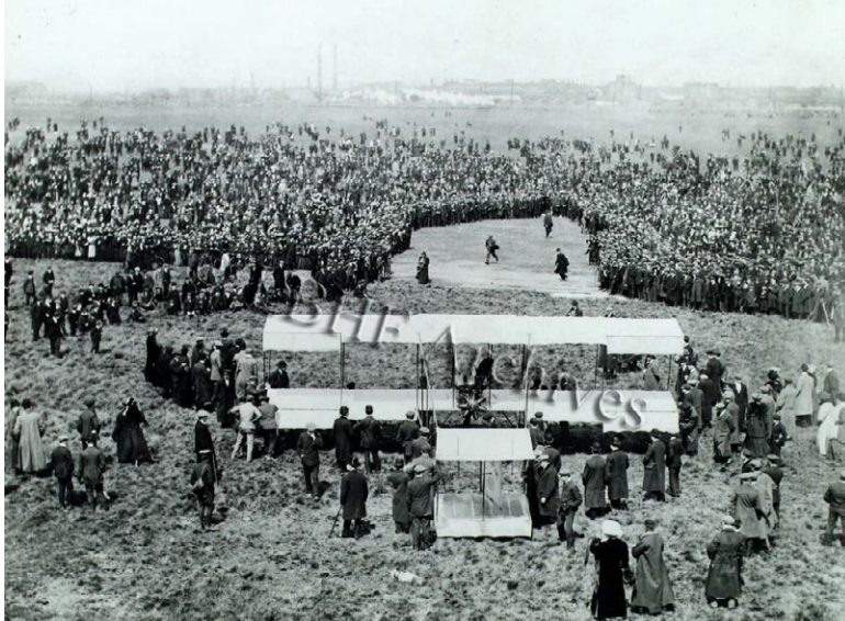
London to Manchester aeroplane race