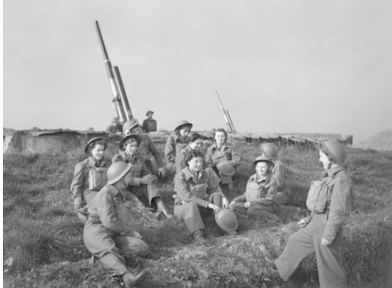
Women at the anti-aircraft gun site