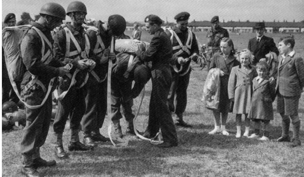
Parachutists and residents gathering to watch