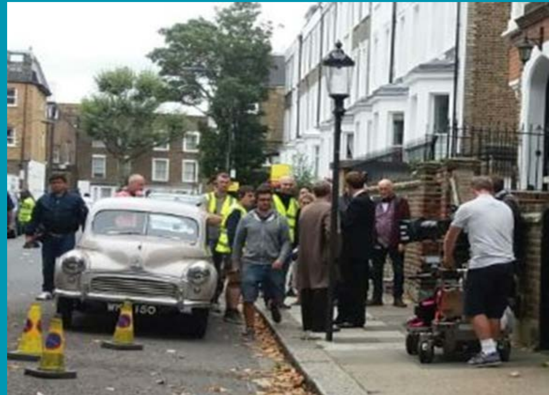
Grantchester on location in Fulham

We also ask you not to block public footpaths with vehicles.