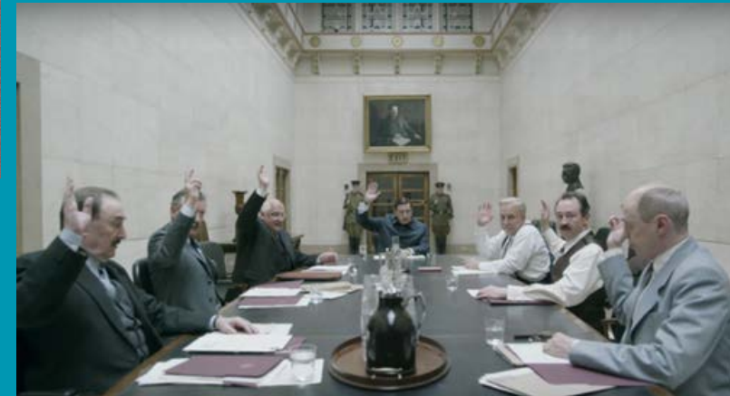
The Death of Stalin at Hammersmith Town Hall