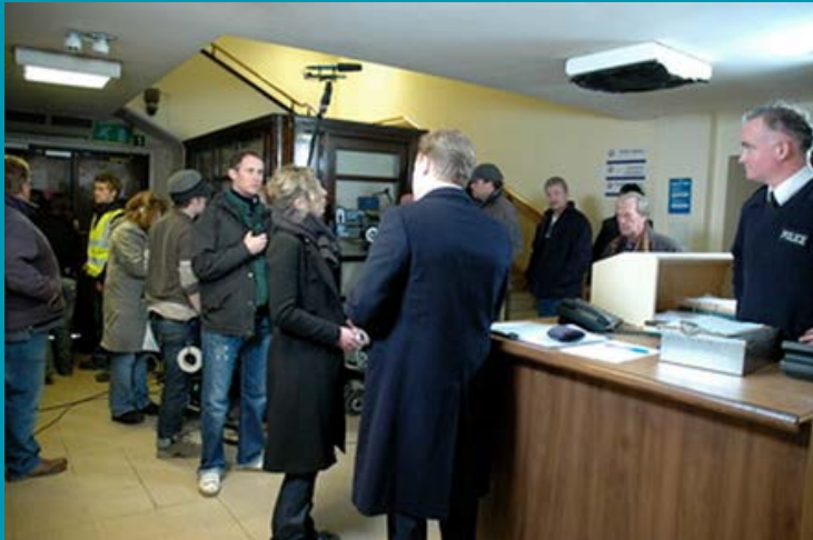
New Tricks at Hammersmith Town Hall