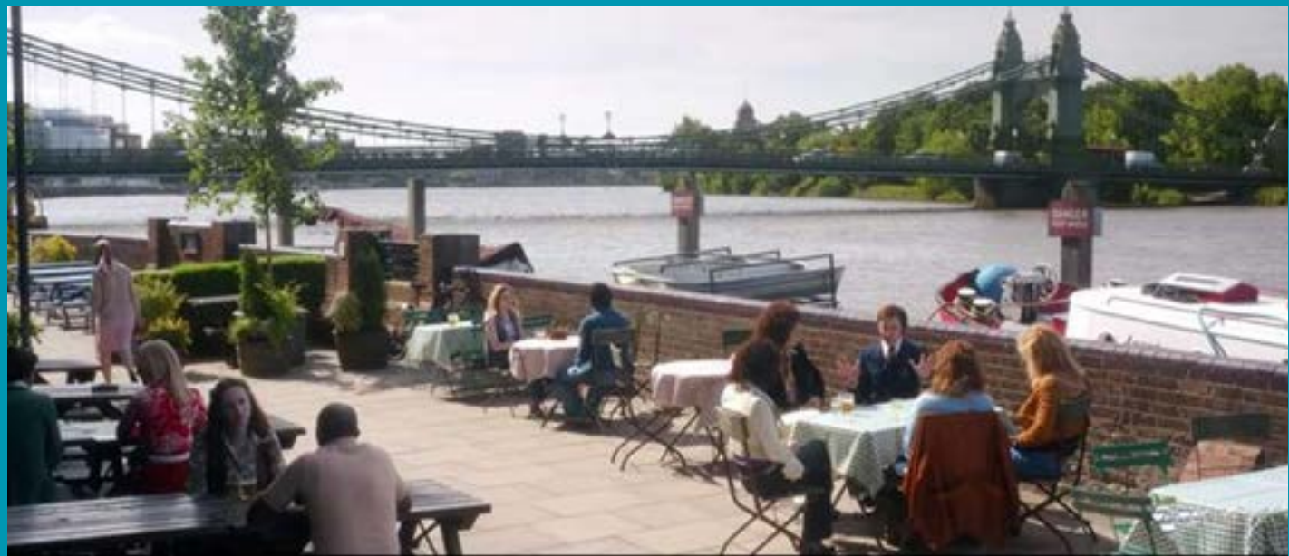
Bohemian Rhapsody on Lower Mall

The British Film Institute offers specific advice about tax relief and co-productions Advice for International Productions | Film London