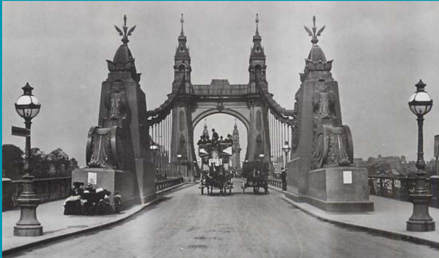
A horse and cart with passengers crossing Hammersmith Bridge during the Victorian era

We fully support filming in Hammersmith and Fulham. All productions wishing to film on any council owned/looked after property must apply for permission to film. All information on lead in times, parking, fees and charges, application forms etc can be found on our website Filming | LBHF