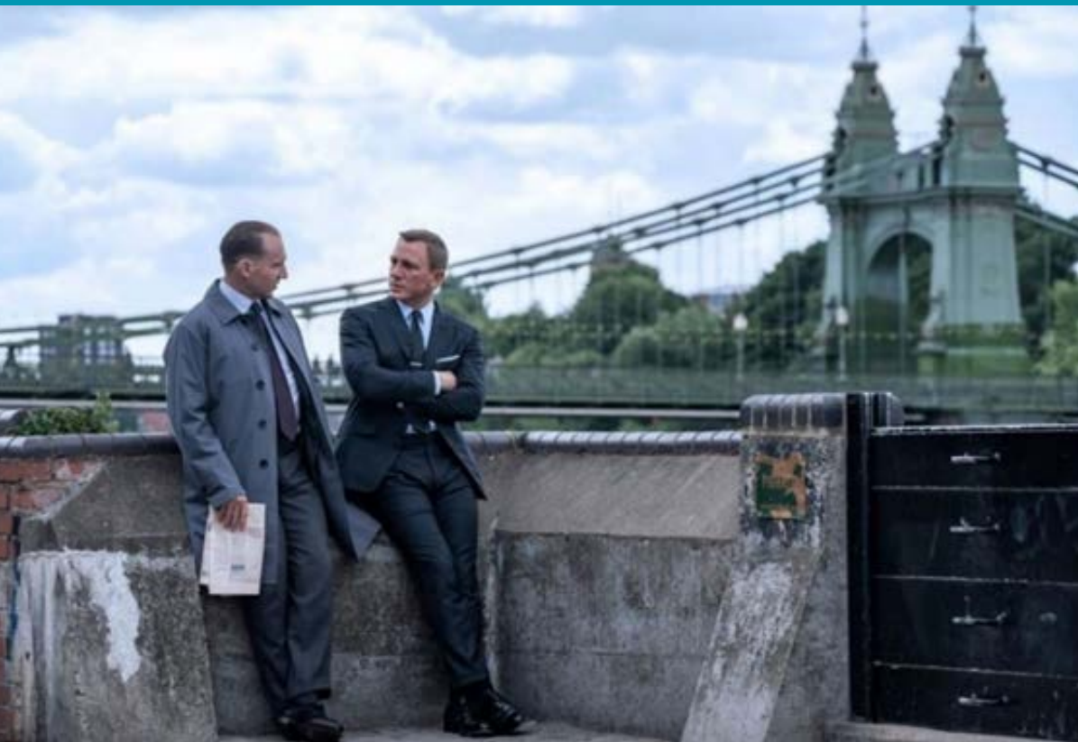
Bond 25 No Time to Die on Lower Mall

To view more features and dramas filmed in the borough see our film map