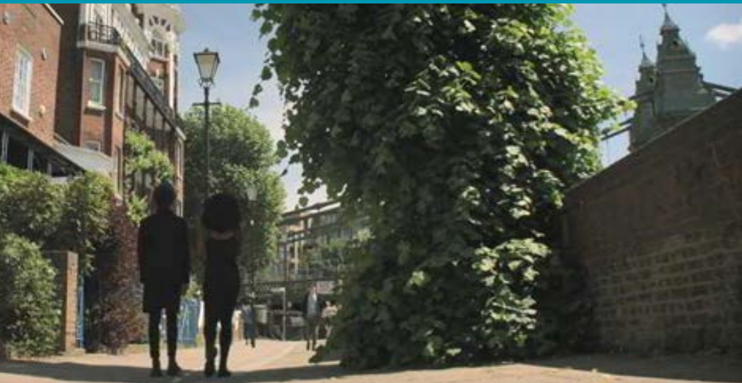
The Sandman on Lower Mall

Transport for London offer guidance on which roads fall under their jurisdiction Filming & photography on the roads - Filming & photography on the roads - Transport for London (tfl.gov.uk) Filming & photography on buses - Transport for London (tfl.gov.uk)