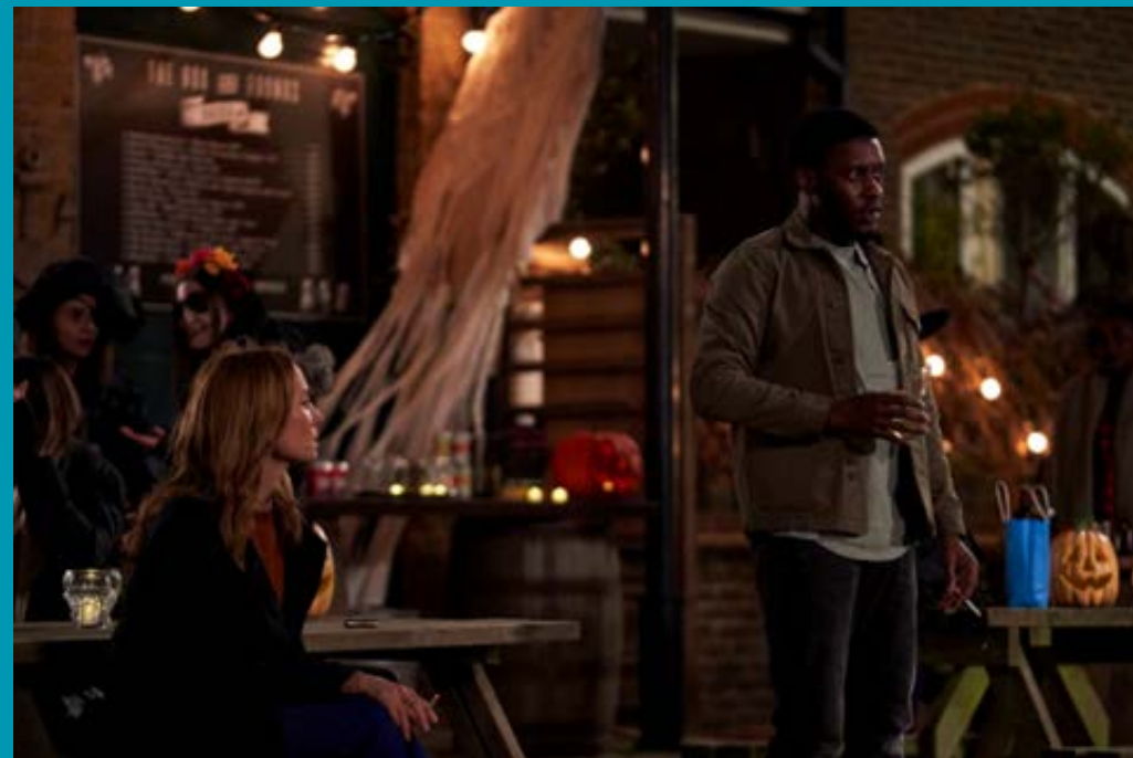
Angela Black on Lower

From large scale feature films and dramas to small student shoots