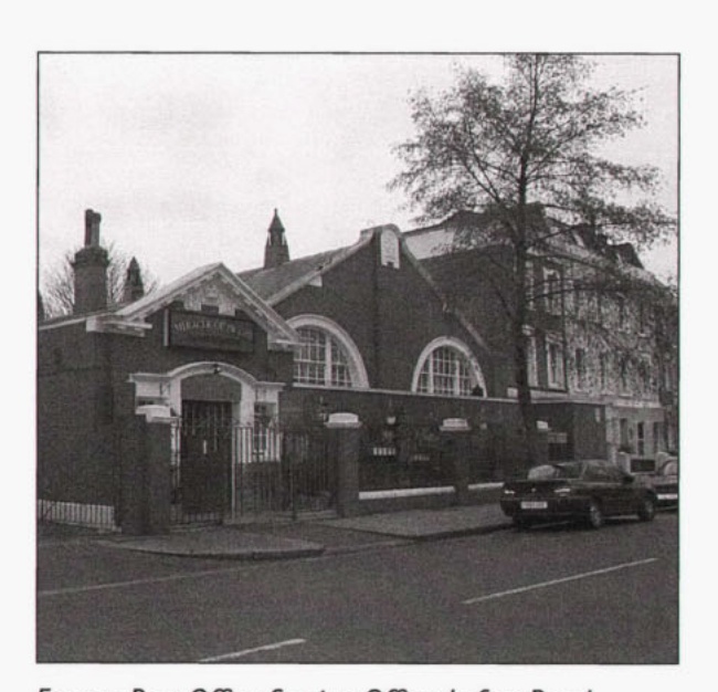
Former Post Office Sorting Office, Loftus Road

(Refer to page 14 of the original profile) Uxbridge Road No. 306 is not a Building of Merit