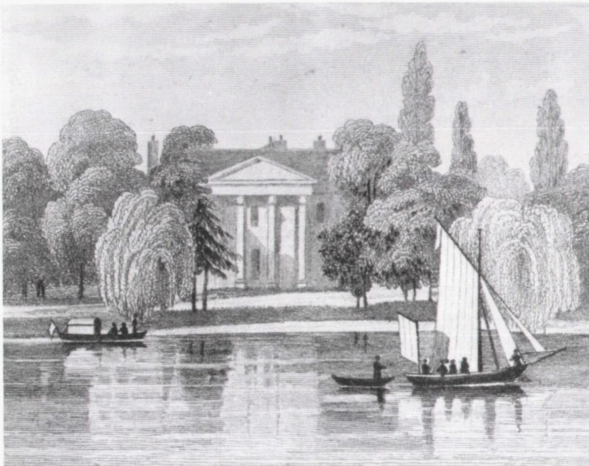
Hurlingham House circa 1840

Volute The scroll or spiral occurring in Ionic, Corinthian and Composite capitals.