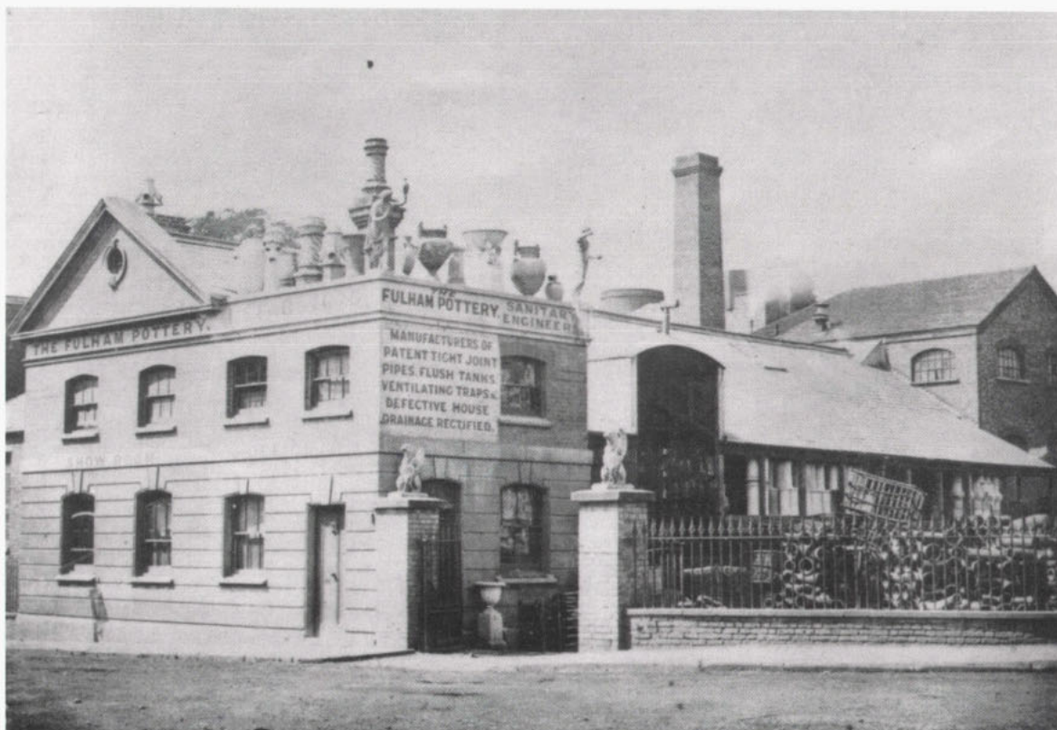
Fulham Pottery circa 1876

Hammersmith and Fulham Archives and Local History Centre