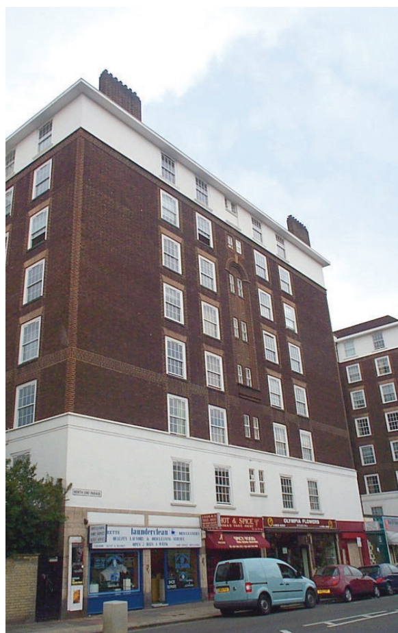
North End Road elevation of North End House

The apartment blocks are in a reddish brown brick with a tiled roof and windows are multi-paned sashes. Both the first and eighth storeys are rendered and painted white, as is the ground floor and basement on the rear elevation. The tall brick chimney stacks appear as prominent features in views along North End Road. The entrance to each of the apartment blocks is at the rear, up a short flight of steps flanked by a pair of Art Deco lanterns.