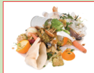
X Food waste