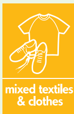
mixed textiles & clothes

Recycle small electrical items, such as mobile phones and hair dryers, by organising a free collection from Traid. To book, call 020 8733 2595 , or visit our website.