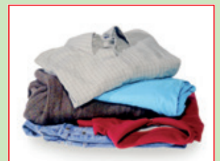
X Clothes and textiles (see left)