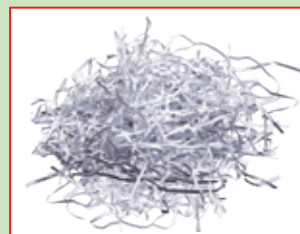
X Shredded paper

Please don't put these in your recycling sack or smart bank: