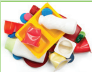
✓ Plastic bottles, pots, tubs and trays