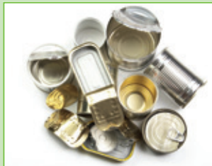
✓ Cans and tins