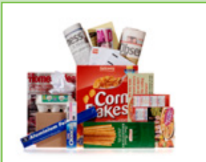
✓ Paper, card and cardboard

Please put all these in your recycling sack or smart bank: