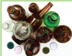
✓ Glass bottles and jars