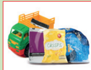
X Hard plastics and soft plastics