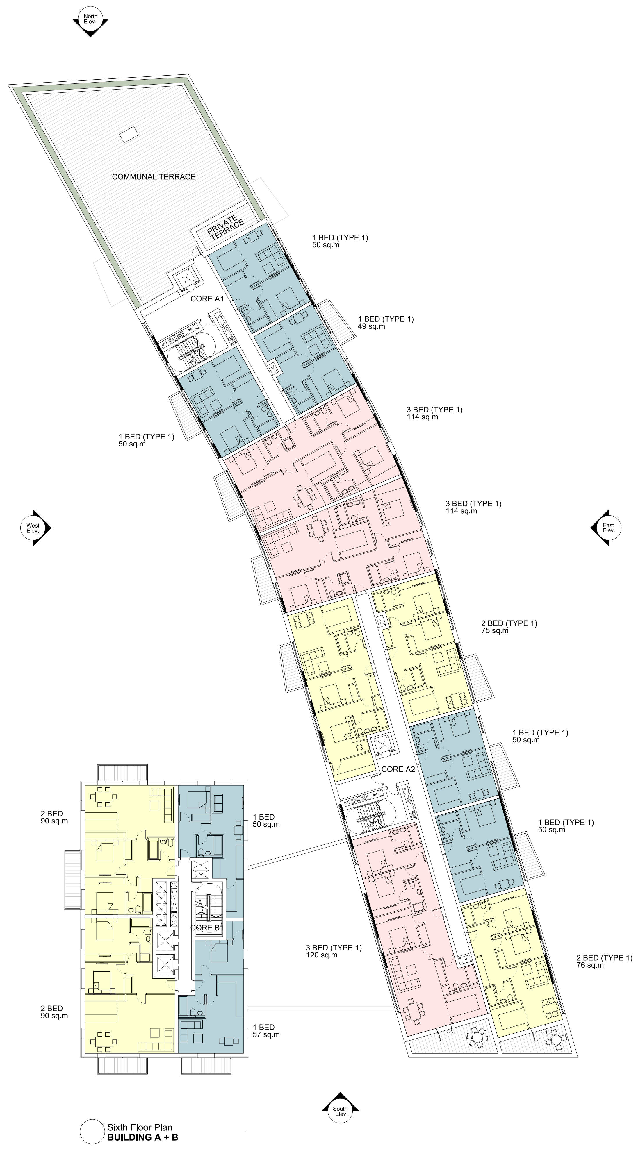
Sixth Floor Plan BUILDING A + B