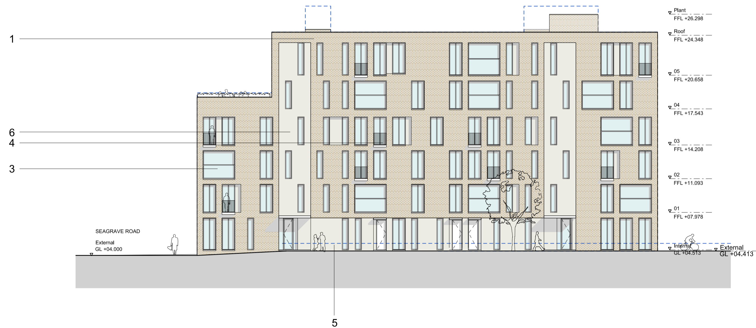
South Elevation BUILDING H