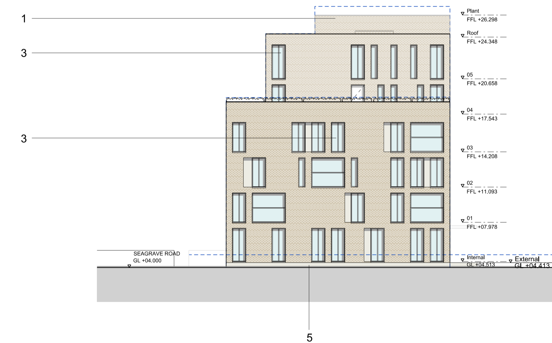
West Elevation BUILDING H