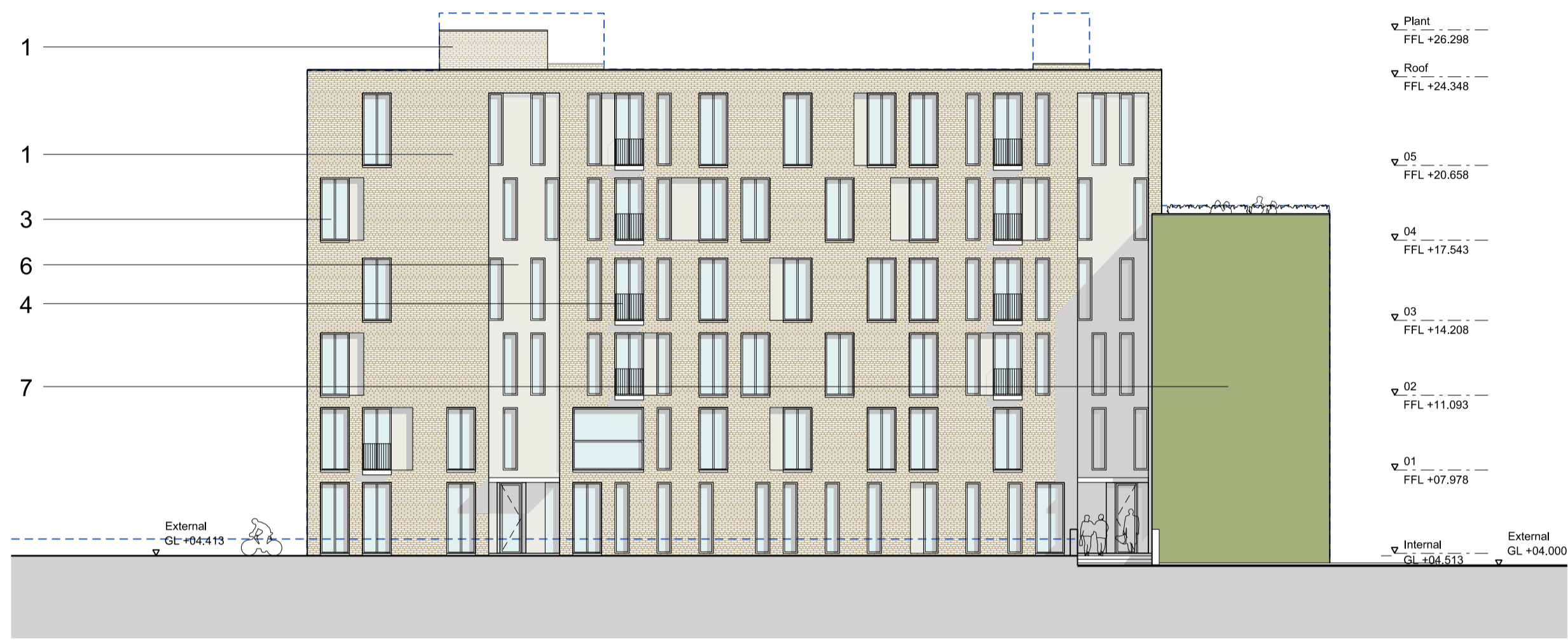
North Elevation BUILDING H