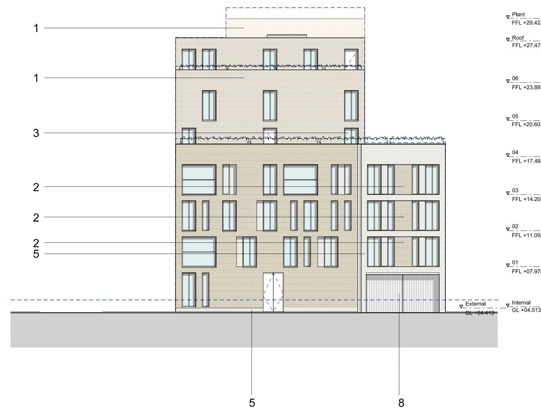
West Elevation BUILDING G