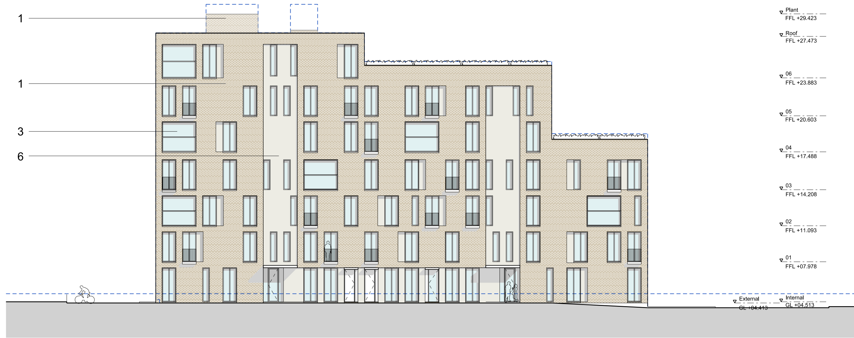
North Elevation BUILDING G