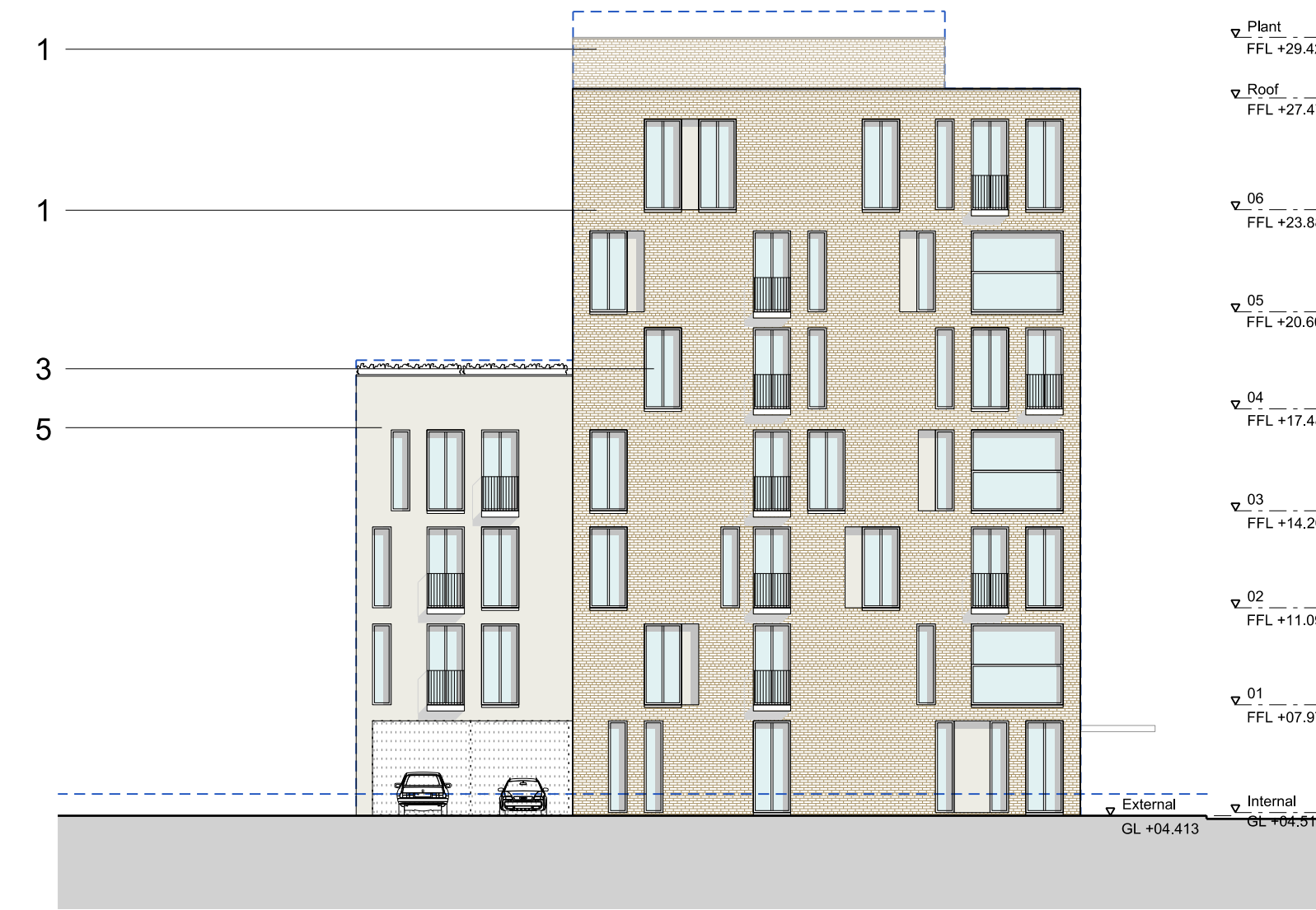
East Elevation BUILDING G