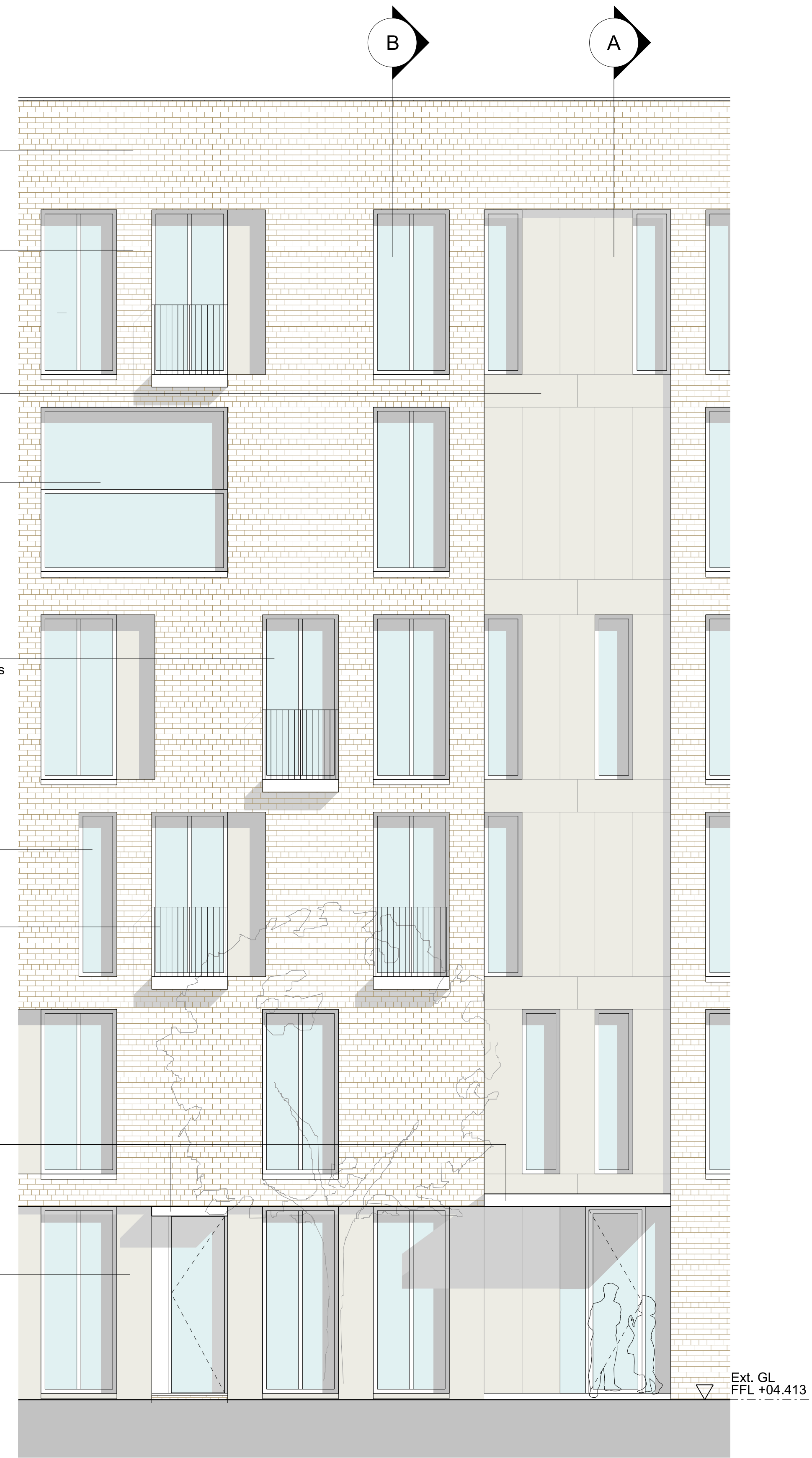
C North Elevation - typical bay BUILDING G