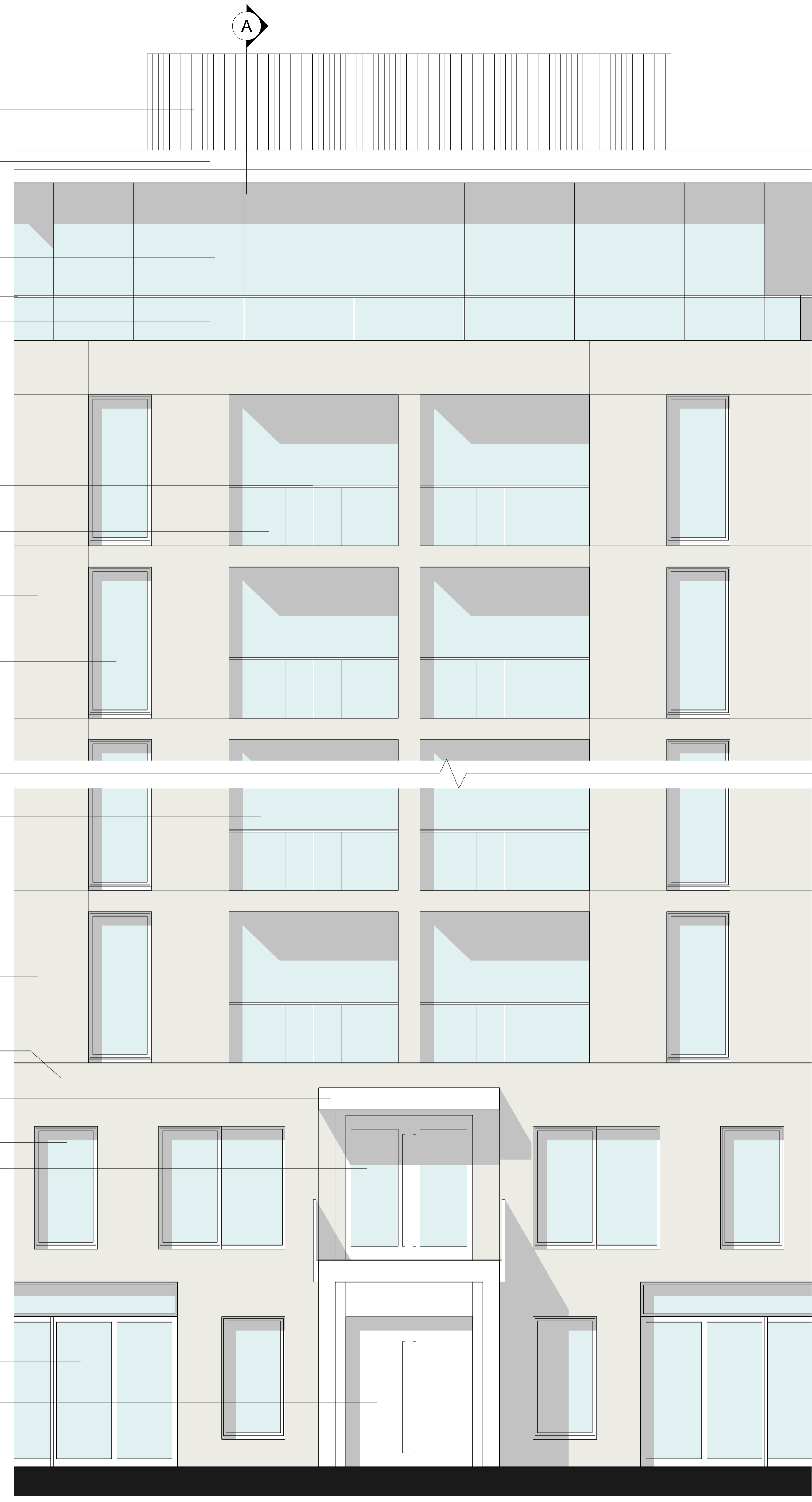
B Typical bay Elevation BUILDING F