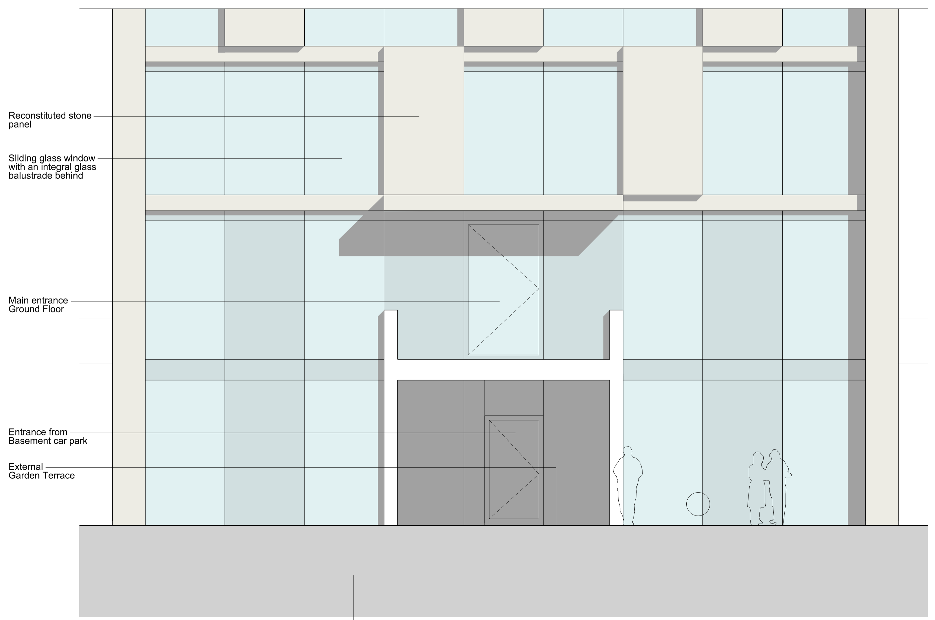
B Typical bay Elevation BUILDING E

Project Logo Notes Do not scale from this drawing. All dimensions are to be checked on site and any discrepancies noted in writing to the Project Manager. All dimensions are in millimeters unless noted otherwise. Rev. Date Description Drawn Checked 17.06.11 Issued for Planning JMP JD A 04.11.11 Issued for Planning, Amended Scheme. JMP JD