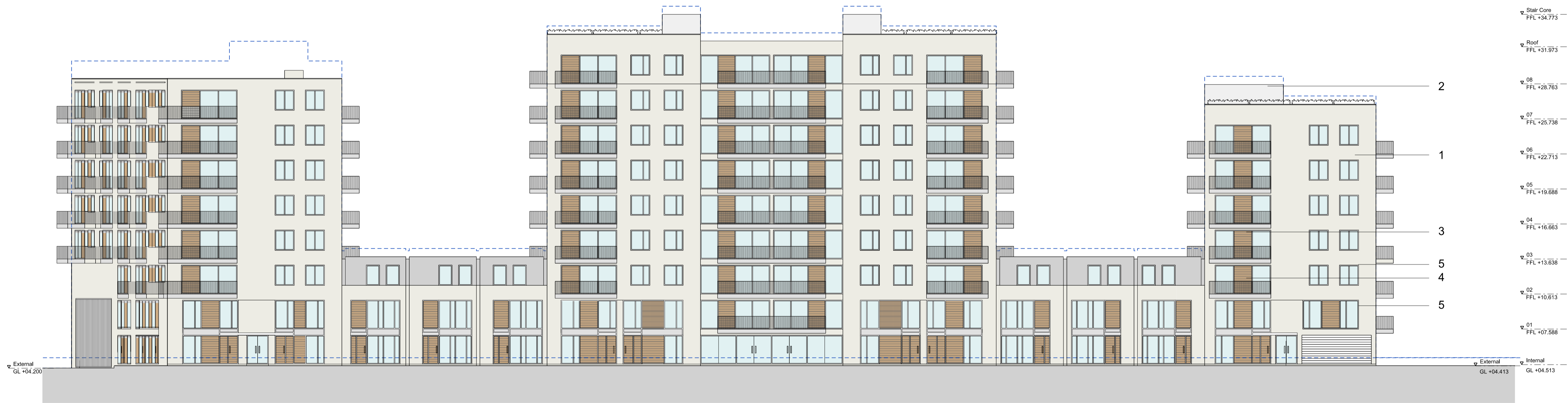
North Elevation BUILDING D