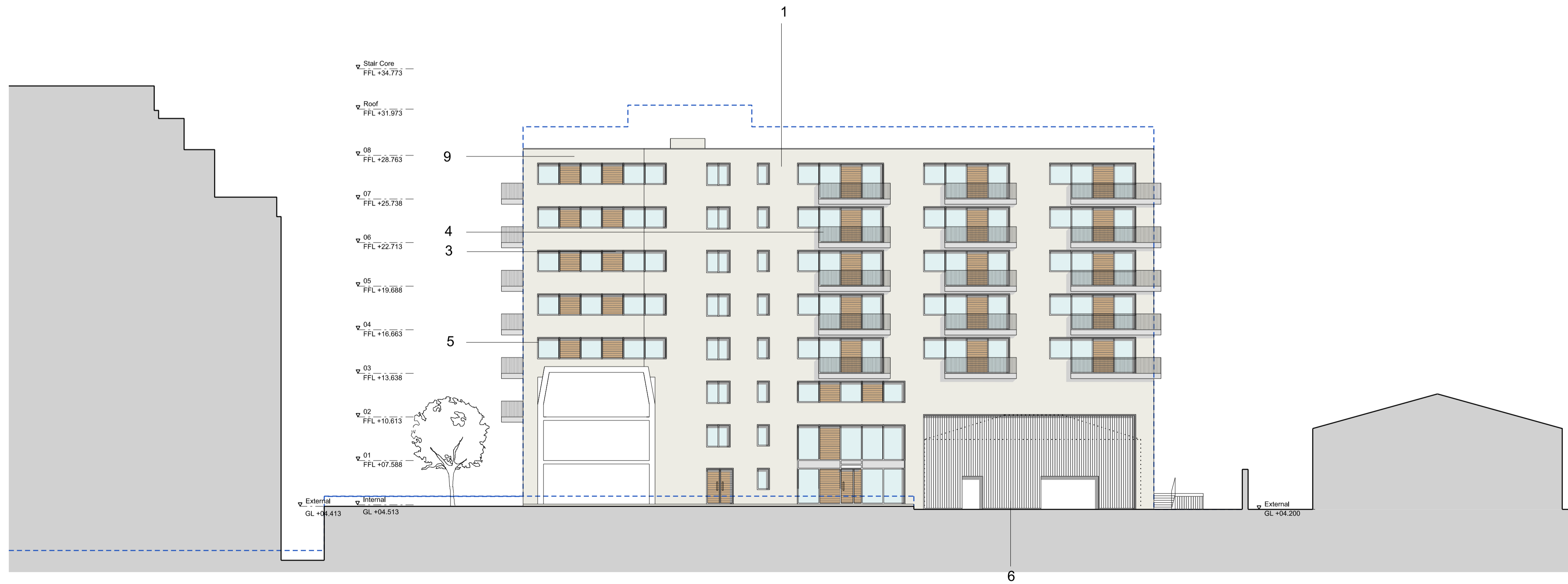
West Elevation Block 4 BUILDING D