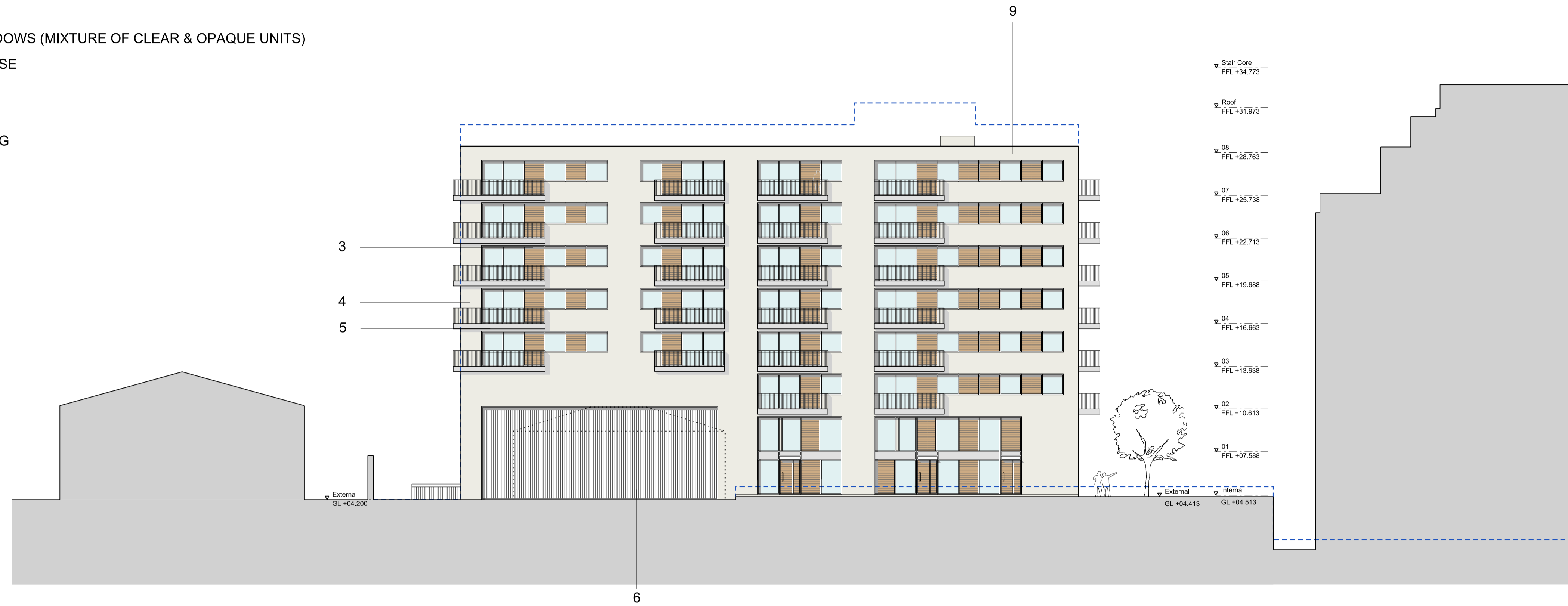
East Elevation Block 4 BUILDING D