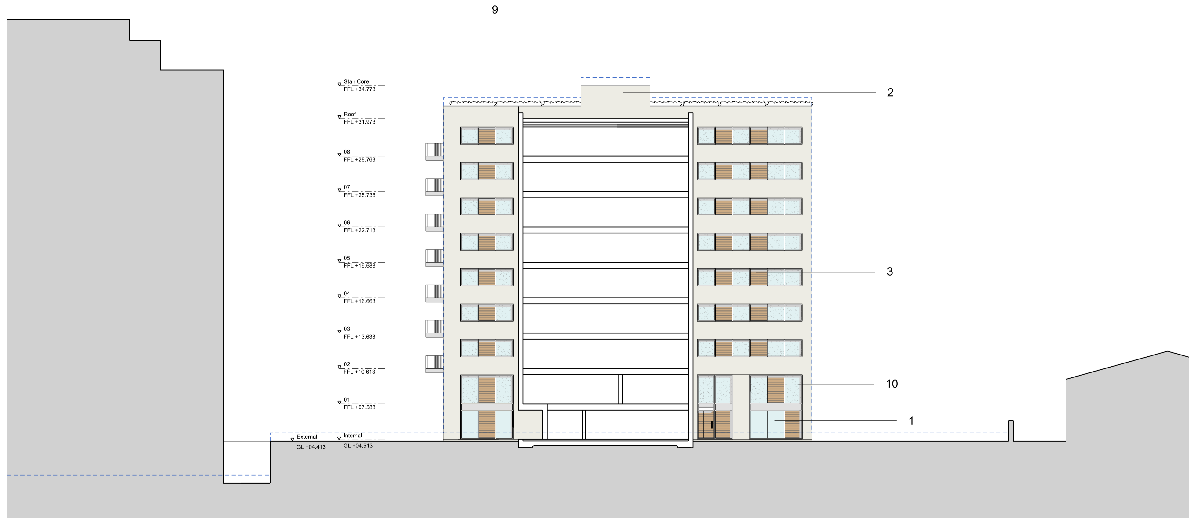
West Elevation Block 3 BUILDING D