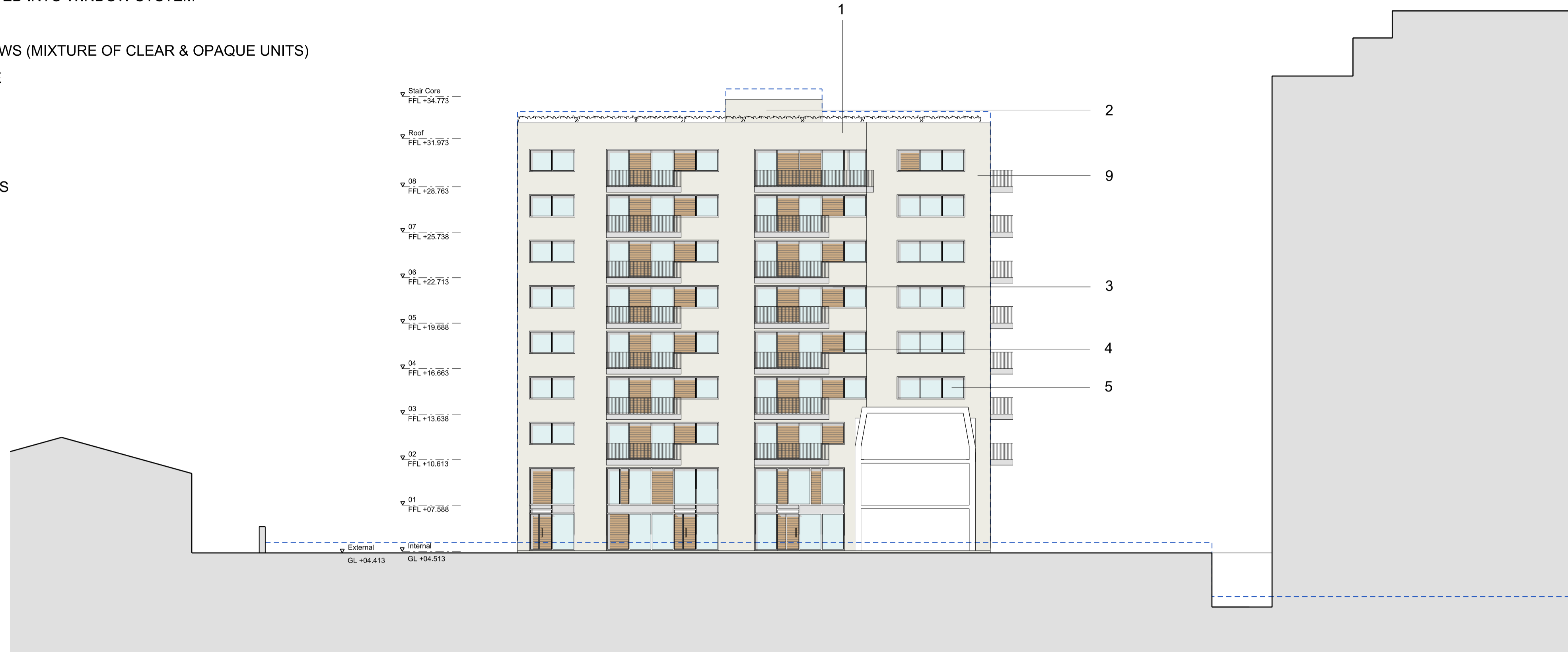
East Elevation Block 3 BUILDING D