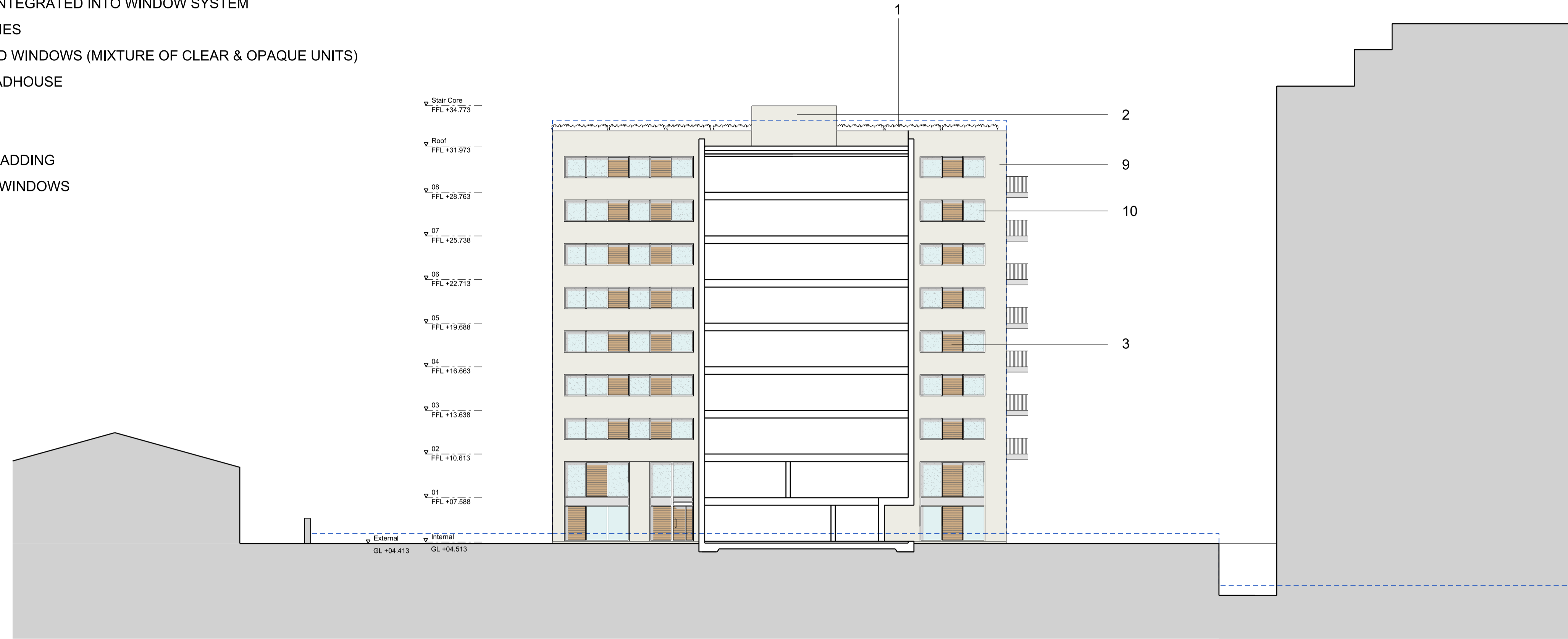
East Elevation Block 2 BUILDING D