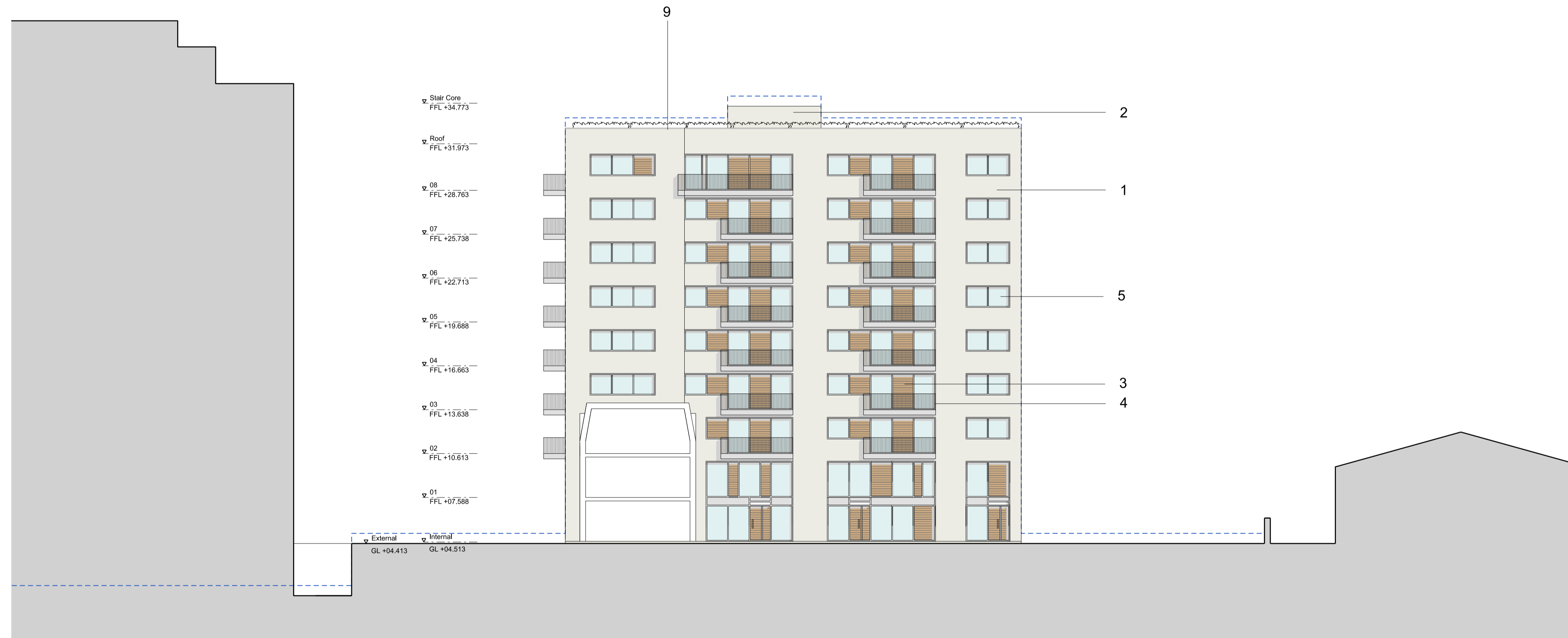
West Elevation Block 2 BUILDING D