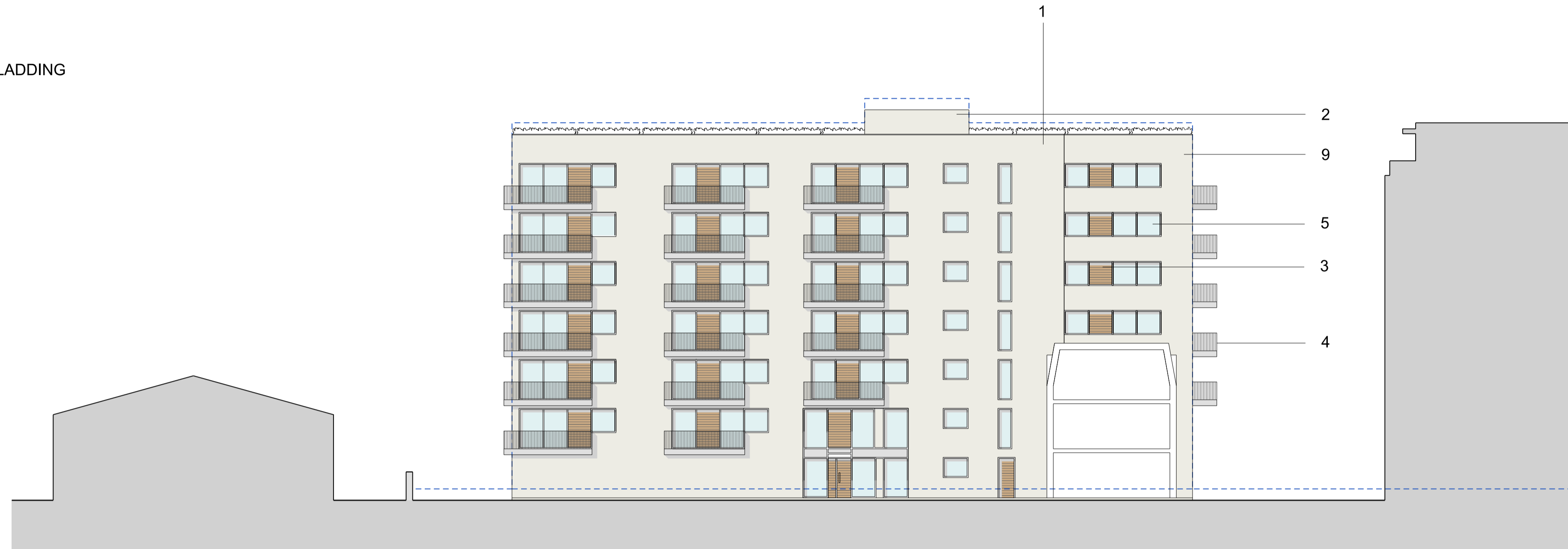
East Elevation Block 1 BUILDING D