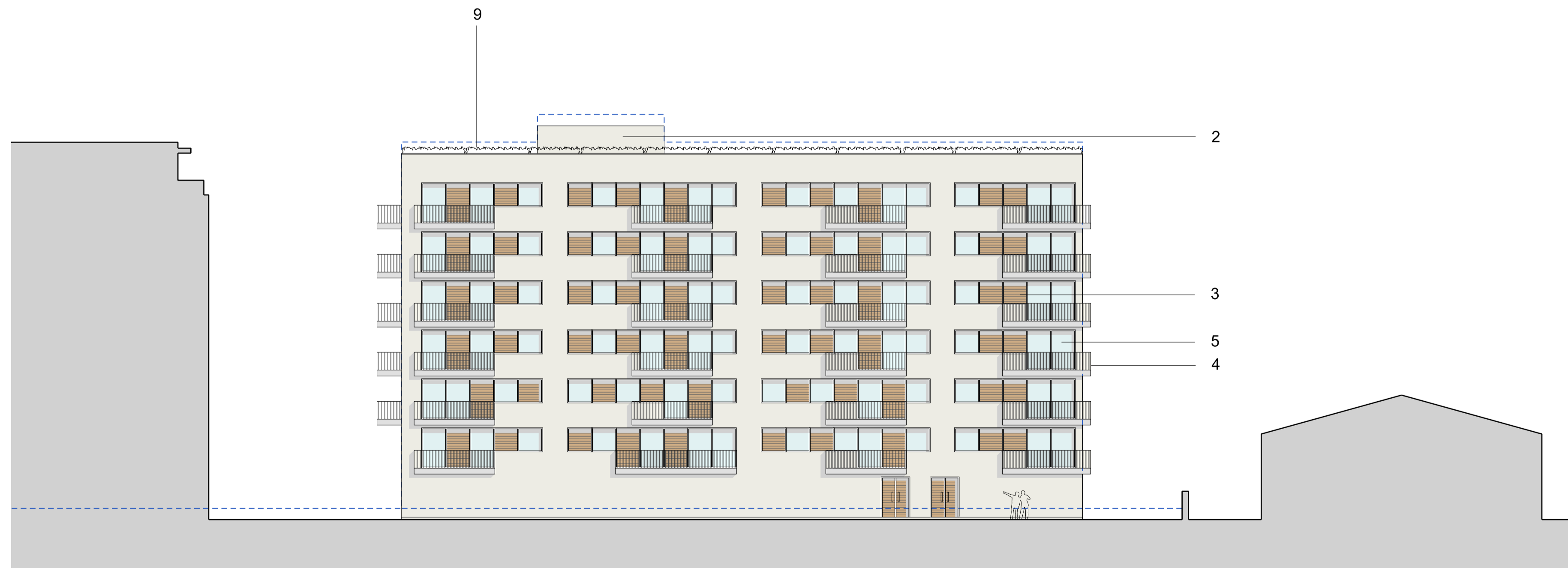
West Elevation Block 1 BUILDING D