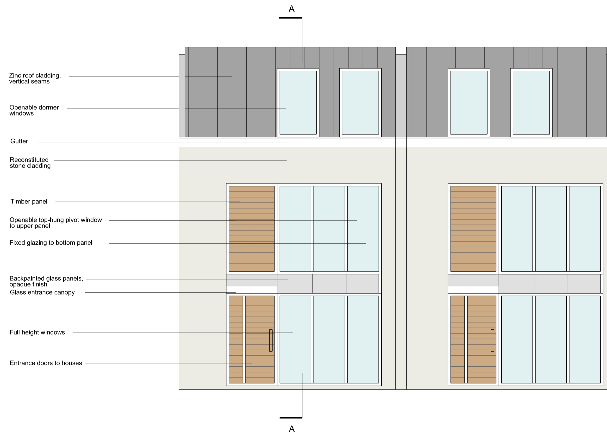
B North Elevation_Typical townhouse BUILDING D