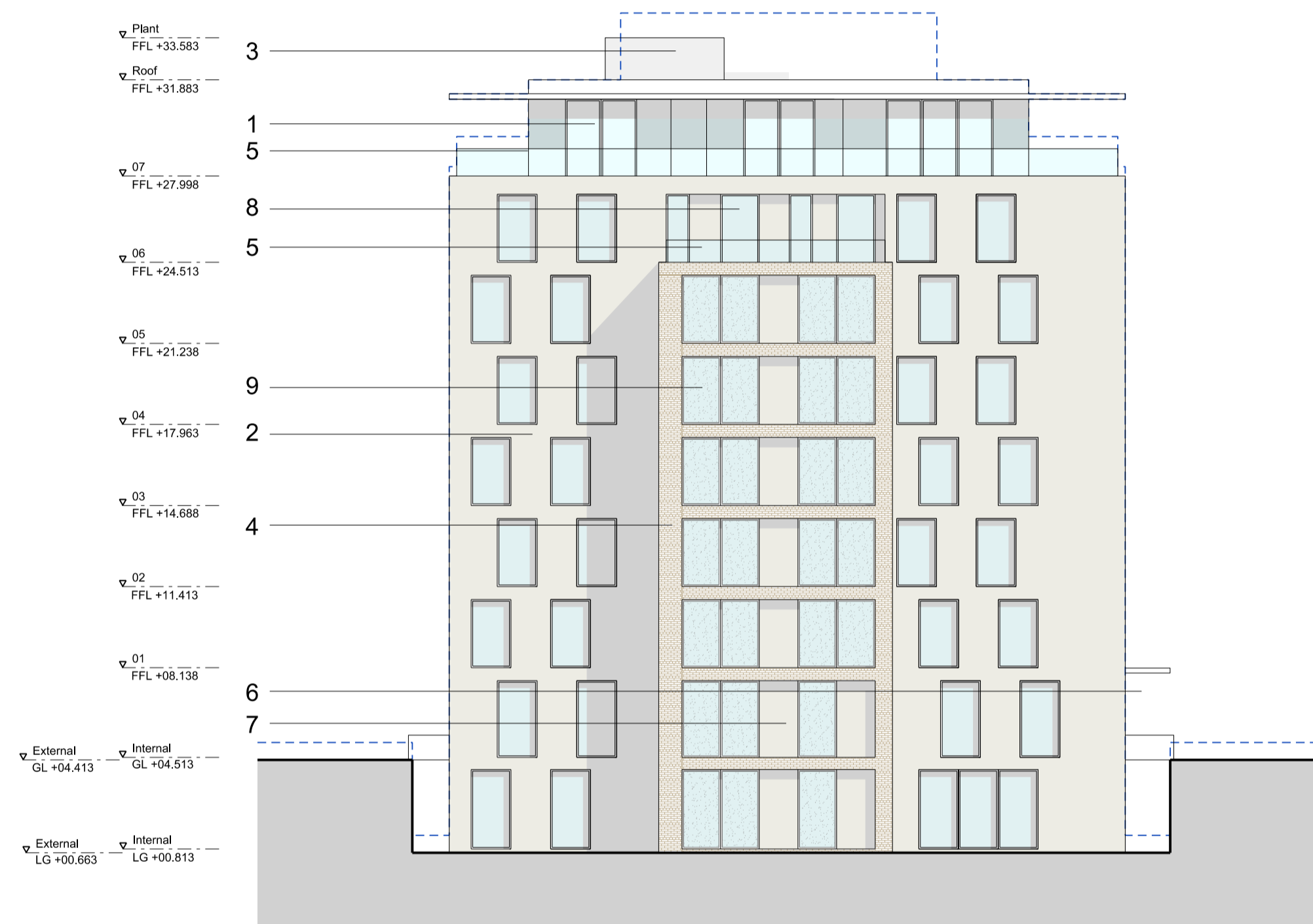
North Elevation BUILDING C