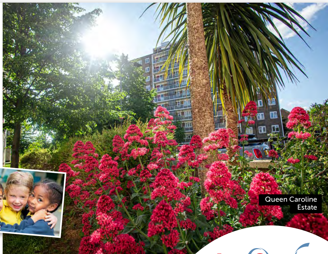
Queen Caroline Estate

BUILDING A STRONGER, SAFER, KINDER BOROUGH