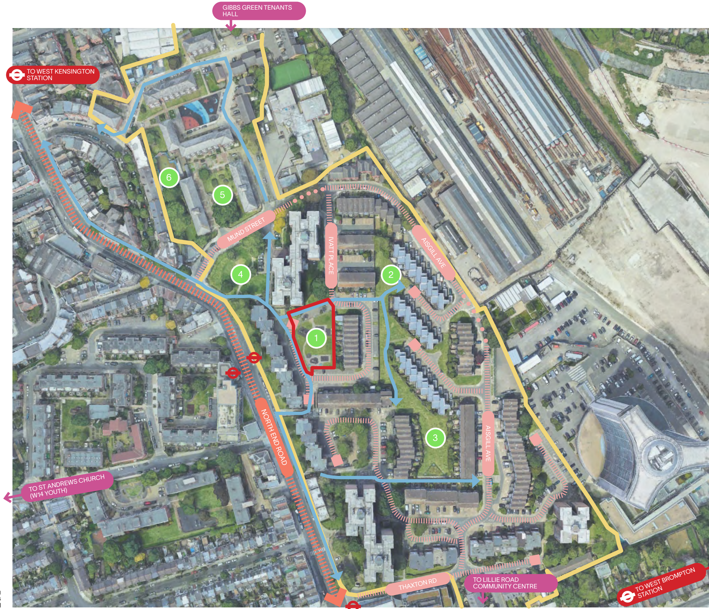
site aerial demonstrating the existing conditions surrounding the playground