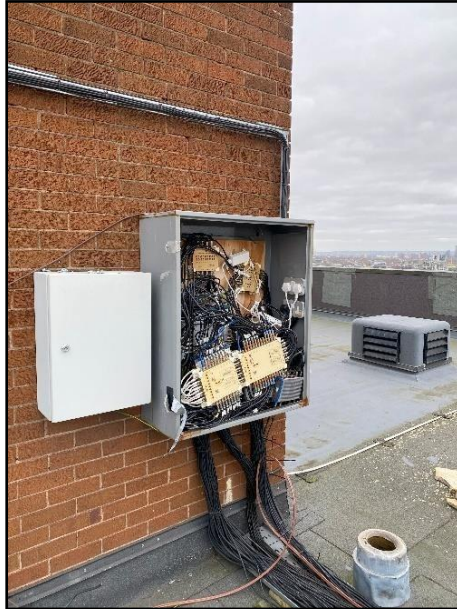
Open cabinet on the roof top.