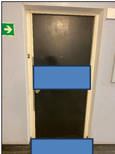
Older style door to Flat xx on Floor 16