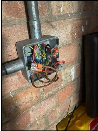
Exposed electrical wiring in light switch.