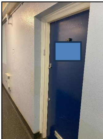
Entrance Door To Flat xx on Floor 7