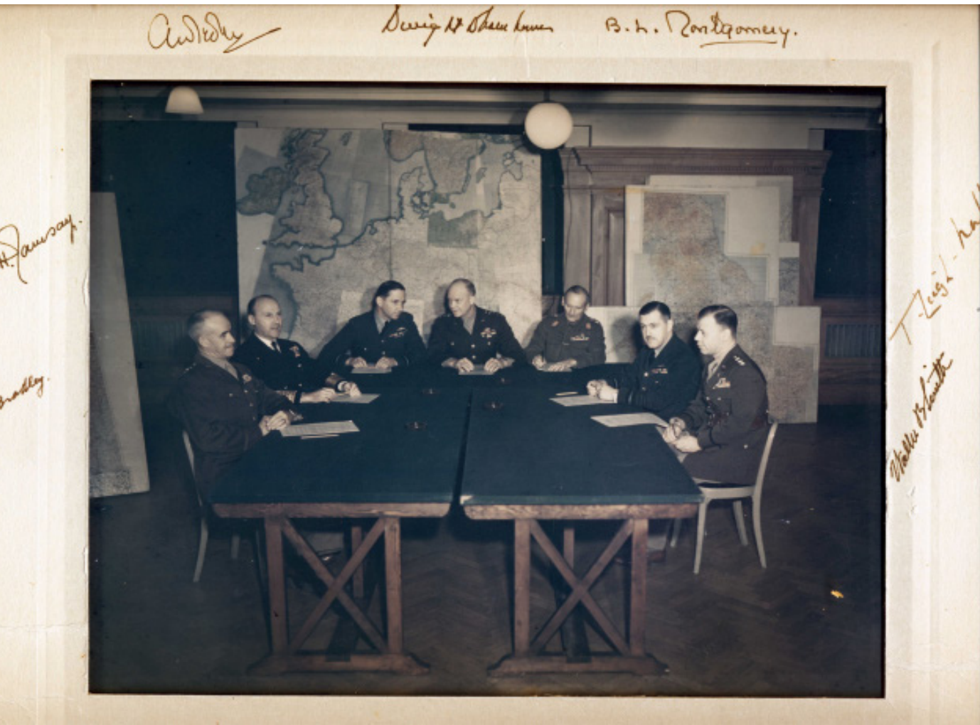
Around the table at invasion Headquarters, London, 1 February 1944. Chiefs of Allied Liberation Forces meeting London. L-R, front row: Air Chief Marshal Sir Arthur Tedder [Deputy Supreme Commander], General Eisenhower [Supreme Commander], General Sir Bernard Montgomery [British Forces], L-R, back row: Lietennant General Bradley [ U.S. Forces], Admiral Ramsay [Royal Navy], Air Chief Marshal Sir Trafford Leigh Mallory [Air C-in-C], Lieutenant General Bedd!! Smith [Chief of Staff].

It later became the headquarters of the 21st Army Group under the command of General Bernard Montgomery. An old pupil of the school, it is said he took great pleasure in occupying the High Master’s office.