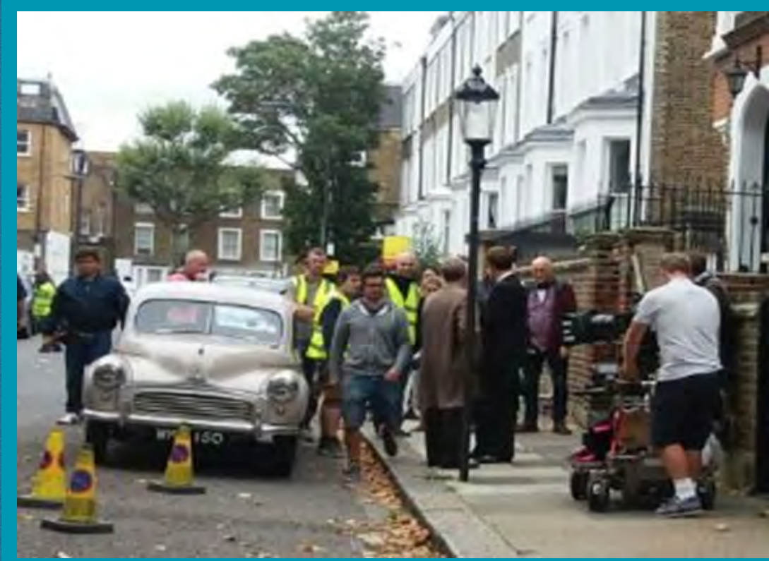
Grantchester on location in Fulham

You should also be prepared to clear the public highway if we or the police ask you to do so. We also ask you not to block public footpaths with vehicles.