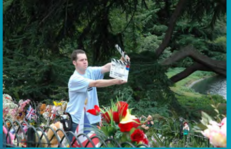
Gideons Daughter in Ravenscourt Park

All productions wishing to film on any council owned/looked after property and large crews intending to film on the highway must apply for permission to film. H&F along with many other councils use a web-based film application system called Filmapp www.filmapp.org.uk