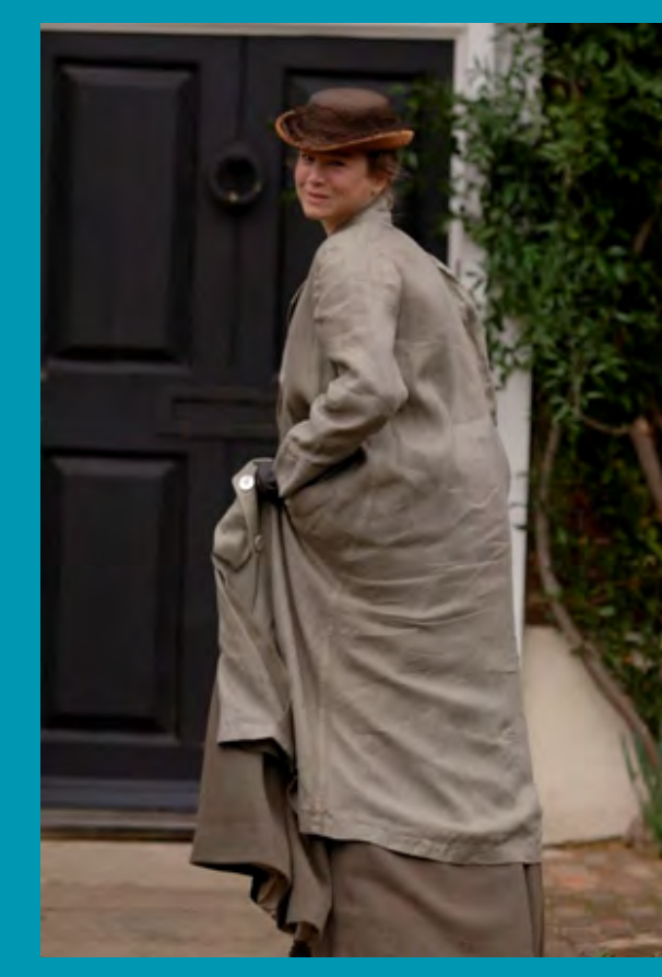
Miss Potter at St Peters Square

Please check our website for information of filming fees and charges <u>Filming fees and notice</u> <u>periods | LBHF</u>