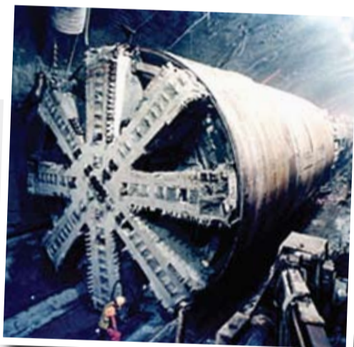
HUGE: Machine used to make the Channel Tunnel