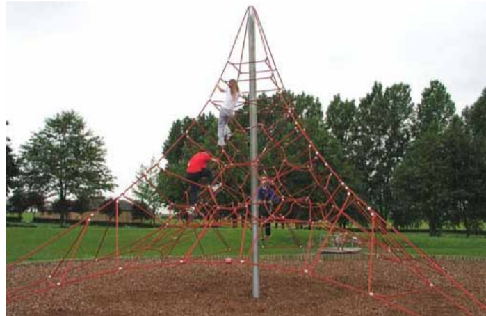
a large space net structure will provide challenge for older children, without dominating the landscape