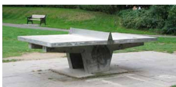
concrete table tennis tables will provide additional entertainment