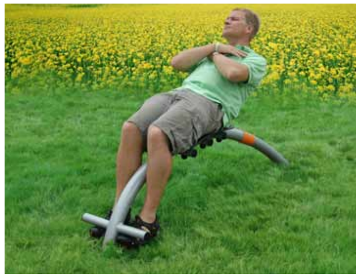
gym equipment will extend the age range catered for