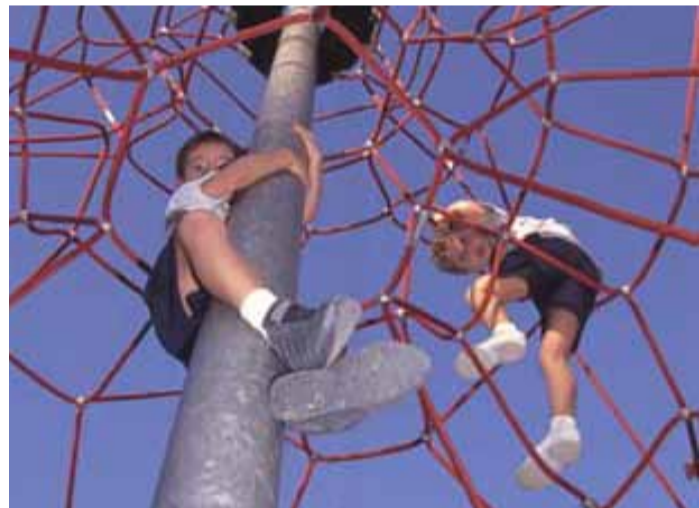
climbing the space net will challenge all age groups and abilities