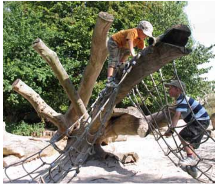
fallen trees and nets provide excellent free play opportunities