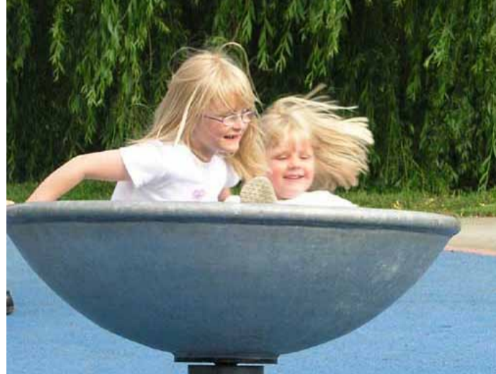
rotating dishes installed adjacent to kick around area