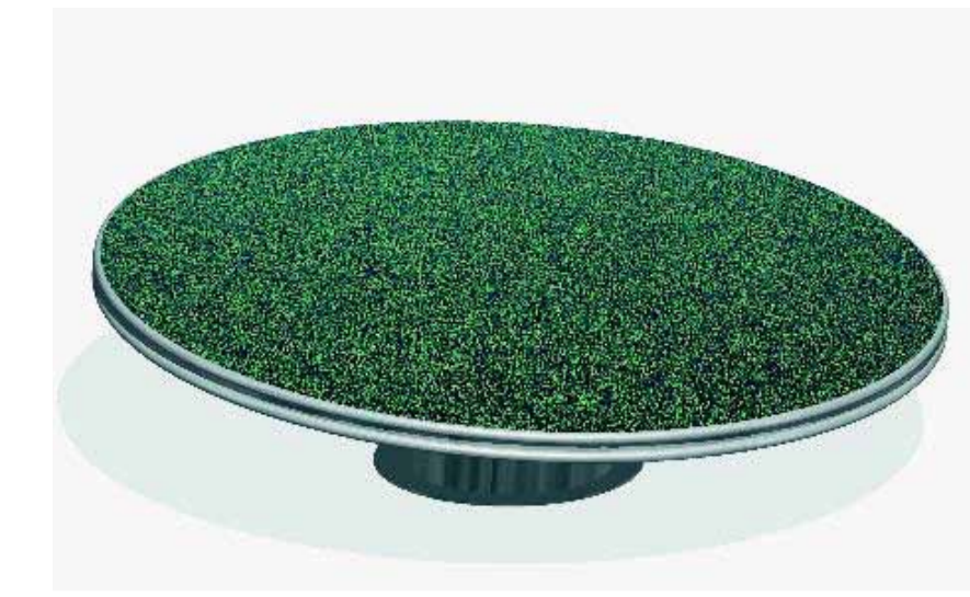
rotating dutch disc

There is currently no play provision for older children in the 8-14 age range. We propose installing a tall Space Net feature that will encourage climbing and present a challenge for older children. This structure will be sited to the west side of the tennis courts and positioned to blend into the mature trees, additional tree planting and gentle mounds will border this play area, softening the impact. A rotating disc will provide both dynamic play and inclusive play facility, in addition new gym equipment and concrete table tennis tables will be installed to extend the age range catered for.