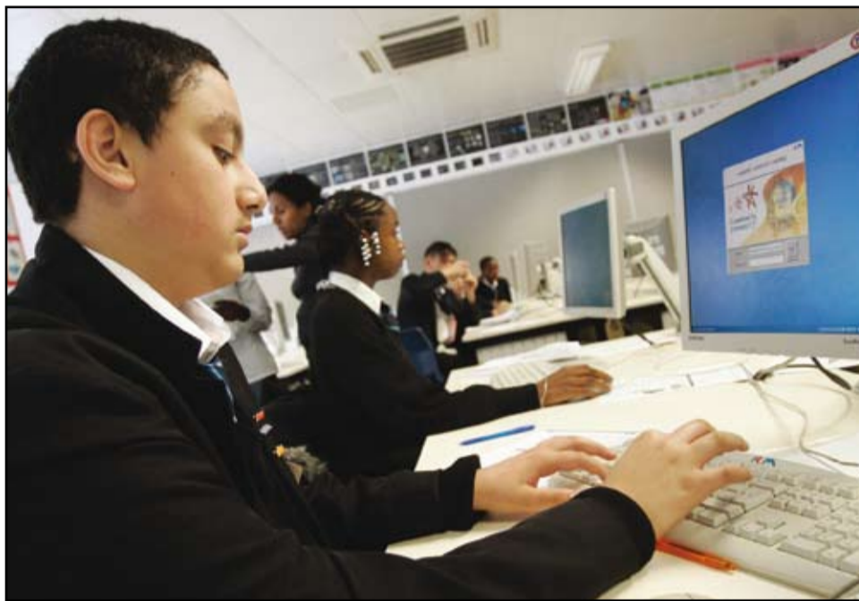
WIRED UP: Pupils will be able to explore the learning power of technology

Further consultation will take place in the summer once a planning application has