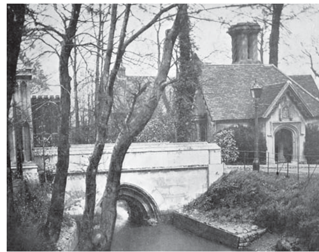
Moat Bridge & Gothic Lodge, c. 1897