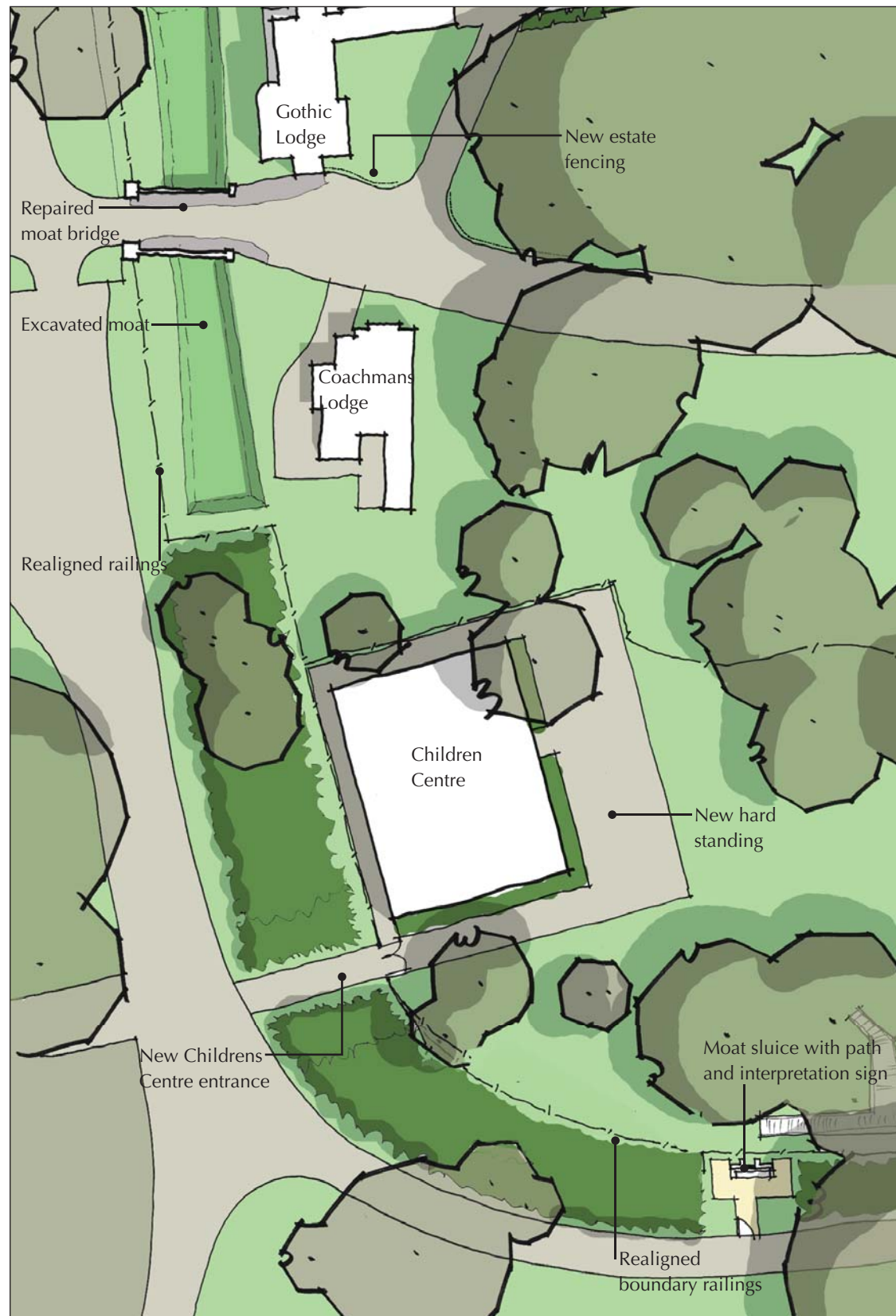
Plan Scale 1:500