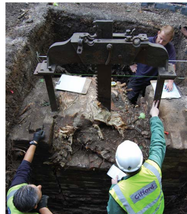
Moat Sluice - recent archeological excavations