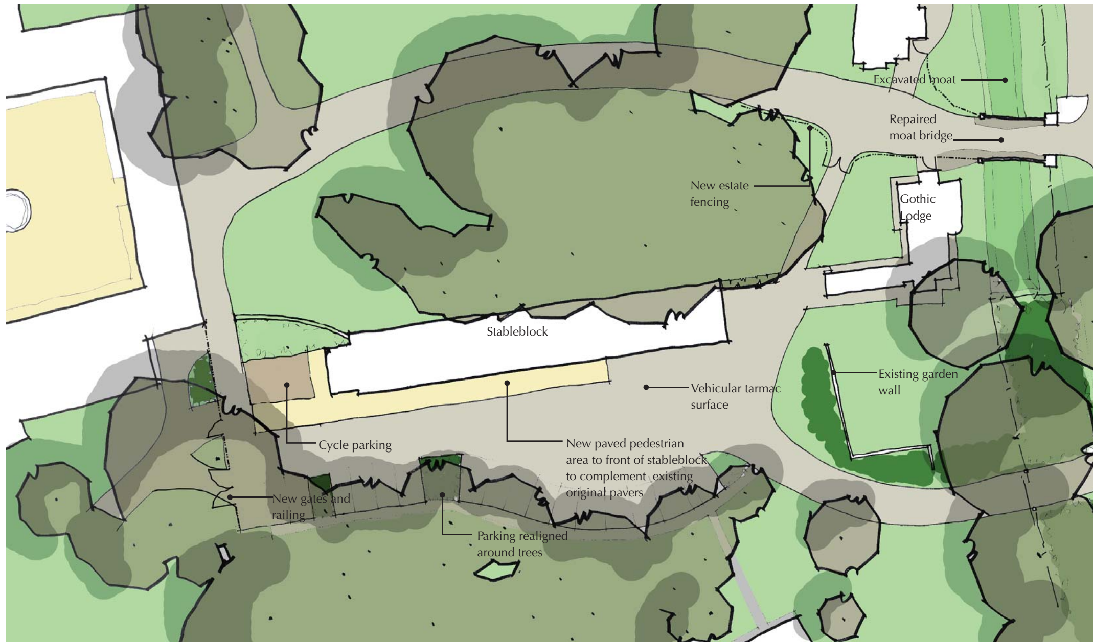
Plan Scale 1:500