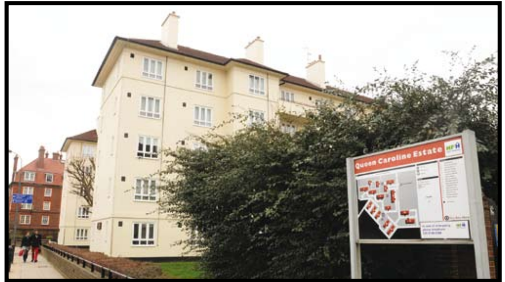
KNOW THE DRILL: Residents of the Queen Caroline estate are braced for Thames Water works