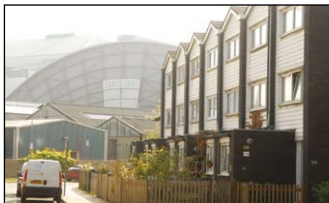
POTENTIAL REGENERATION: West Kensington Estate

Development Framework Core Strategy Options, is currently out for consultation. You can have your say up until July 17 by logging on to www.lbhf.gov.uk/decentneighbourhoods